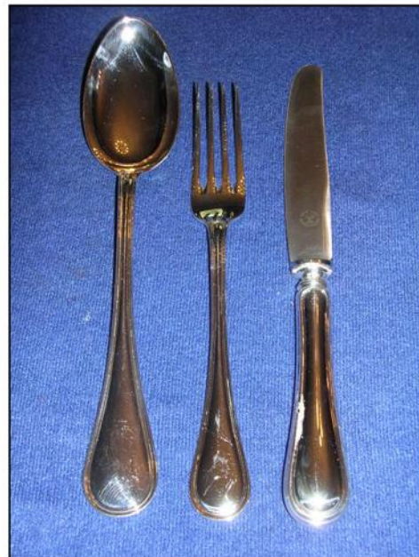
Some of the many contemporary designs now offered by Jarosinski & Vaugoin.